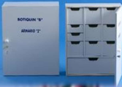
BOTIQUINES NAVALES TIPO A Y C