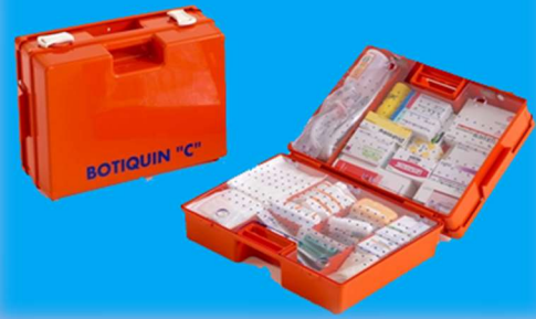
BOTIQUINES NAVALES TIPO C