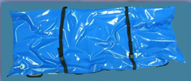
COLCHON DE VACIO 210X80